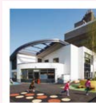
One of the many outdoor spaces children can access

Prior Weston School and Children's Centre is a special place in a unique location. Every morning, I have the pleasure of welcoming the children and families into our amazing building. We truly are a school in the heart of the community it serves in that we open our doors to the school community each and every day.