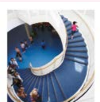
Modern, bright facilities