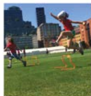
Sports day at HAC

The creative arts and P.E. are a focus at Prior Weston. We are a partner school with Music Masters. Through this award-winning music programme children are taught a wide range of skills from Reception to Year 6. From Year 1 all children start to learn the violin or cello, enabling them to build their musical skills.