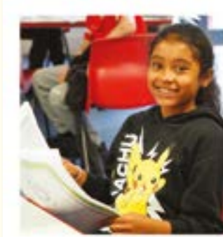
Enjoying learning is the key to success