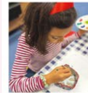
A wide range of fun activities at Night Owls

Night Owls is our after-school provision for children whose families are unable to make the usual pick-up time. The sessions run from 3.30pm till 6.00pm, with pick up any time before 6.00pm.