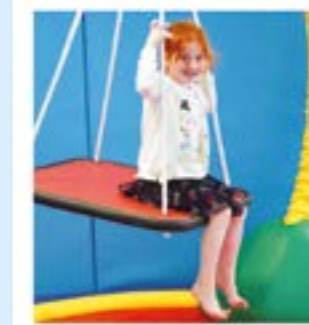
A multi-sensory approach to learning

As part of the Prior Weston’s healthy school programme children are made aware of how they can improve their own health and well-being.