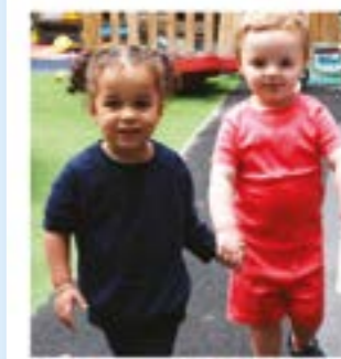
Learning together in the Children’s Centre