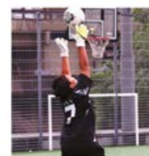
Team Kick Start support PE provision

Application forms can be collected from the Reception desk or downloaded from our website. Once the form is completed, please return it to the Reception desk. Places are offered to children on the application list according to the Council's admissions policy. Siblings are priority followed by distance to the Centre. We do not operate a waiting list. The Centre will contact you by phone and email if your child is allocated a place.