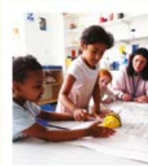
Practical technology in action with BeeBots