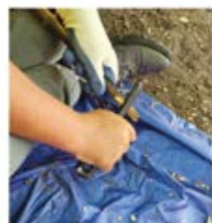
Learning through nature

Many other events are held throughout the year and parents will be informed of these in advance.