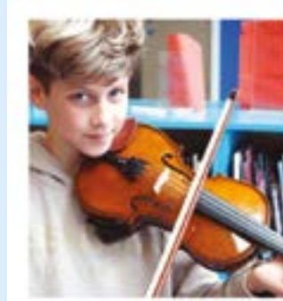
A young violinist at Prior Weston

If you wish to hear more about what we can offer your child, please contact us for more information or an appointment to meet me and look around the school. Get in touch at 020 7786 4800 or office@priorweston.islington.sch.uk