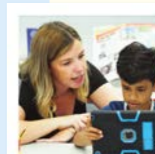
Skilled teachers support pupils to do their best

the quality of the education provision. When carrying out their responsibilities, our governing body acts in the interests of the children and young people in the school and in the wider community. We are always looking for people to add to the expertise of our Governing Body. If you would like to find out more about the role, please contact the school.