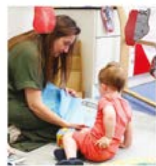
Encouraging a love of reading from the earliest years