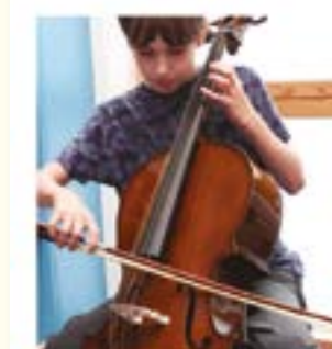
A young cellist at Prior Weston