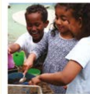
Learning through play in Early Years

are in receipt of certain benefits may also be entitled to free school meals. Details are available at school if you feel that you may be eligible.