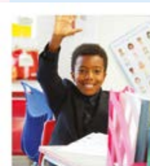
Behaviour at Prior Weston is excellent

At Prior Weston, we take pride in being a non-uniform school; it’s a long-standing tradition that we hold dear. We believe that a sense of community and belonging can be created without everyone looking the same. Our diversity and differences are what make Prior Weston a unique and special school, and we embrace and celebrate them. We value each child for their individuality, and not having a school uniform allows them to express themselves freely. Our only proviso is that clothing should be comfortable and appropriate for both the weather and activities.