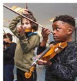
All pupils in Year 1 and 2 learn the violin or cello

Our modern foreign language is Spanish. This is taught by a specialist Spanish teacher to all children in Key Stage 2.