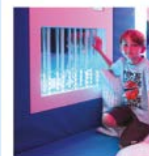
Superb facilities to support all children

Within the school we have a number of family and community members who volunteer their time and effort in various ways for the children. Whether it is spending precious moments with pupils in the mornings during reading sessions, or at clubs before and after school, the time that you give us is invaluable.